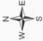
Exhibit A (cont.)