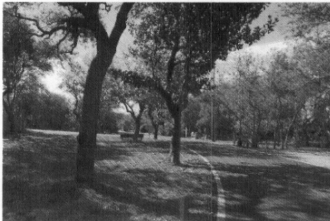
Bishop Street in the Beach Highland Neighborhood

Covenants and restrictions that controlled land development in the subdivision were established in January of 1961. Among other development standards, the covenants and restrictions limited development in the subdivision to single-family residential uses. These covenants and restrictions expired in 2001.