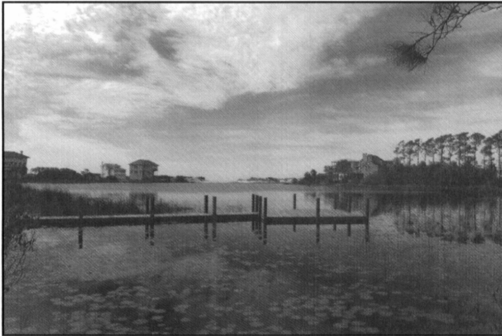
Image of Stallworth Lake in the Beach Highland Neighborhood